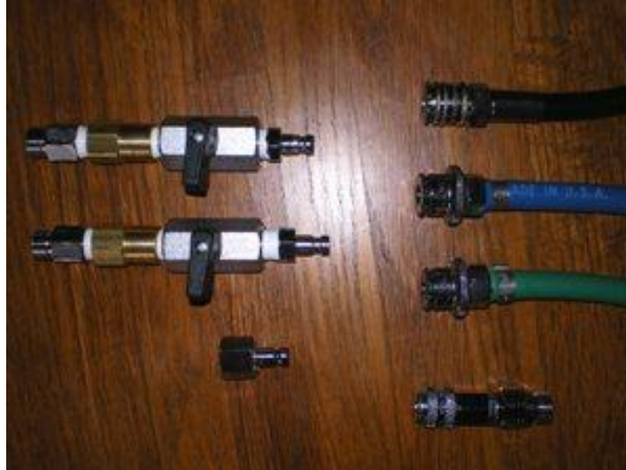
Figure 7: An array of cross-compatible male and female subassemblies.