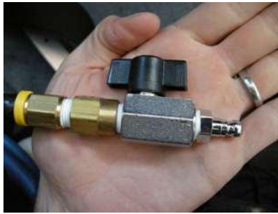
Figure 5: Sample diluent Q/D subassembly.