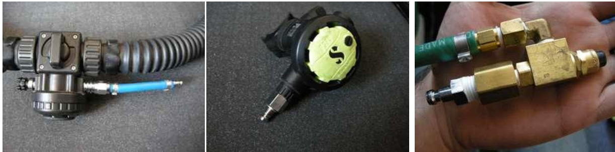
Figure 8: BOV, backup 2nd stage, and MAV, all using CEJN compatible male nipples.