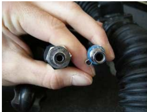
Figure 3: Ocean Reef (left) and CEJN 221 (right) nipples with large bores suitable for supplying breathing gas.

A final advantage to CEJN style fittings, is that they can be used throughout your rig including offboard whips, at manual add valves, and for BC/suit inflation. This consistency used throughout the rebreather gas distribution configuration makes it possible to access any gas supplies at any point in your equipment – which eliminates confusion and anxiety in addressing any number of failure modes. This also allows for full bypass of the rig itself to directly feed the BOV in a full boom scenario.