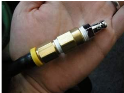
Figure 6: Oxygen Q/D subassembly.

In general, the male oxygen whip assembly should consist of a CEJN-style nipple, and a check valve/non-return valve - only permitting flow into this hose (figure 4). This assembly prevents the onboard gas supply from escaping the whip, and keeps water out of the system when not plugged in. No ball/isolator is used, as there is no risk of using the 'wrong' gas. It's all oxygen. This male assembly is affixed to a LP hose and installed at either the diluent first stage LP port of the onboard oxygen supply, in which case the oxygen first stage serves as your oxygen manifold – OR - to the oxygen manifold in the unit if there is one. In either case, the system is plumbed such that all devices (solenoid, orifice, needle manual add valve, etc) on the rig are fed by the same oxygen supply, either onboard or offboard.