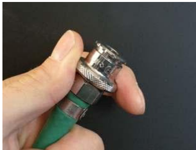
Figure 1: female CEJN 221 fitting.

The original, and very simple advantage, stemming from Series 221 use on drysuits, is the ease of connecting and disconnecting the fittings, even while under pressure, and with heavy gloves on.